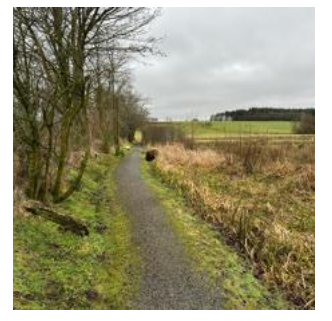
In the afternoon, Jim finished raking up the mud and leaves from the area of the forest road in front of the storage container and bird food store.