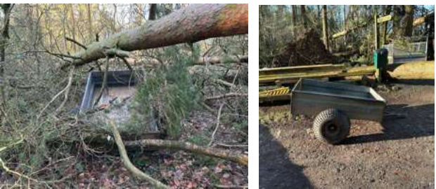
Fri. 31 Derek Campbell and Jim cut down a branch that had broken and fallen across the feeder burn. They then cleared some of the self-seeded birches from an area near the shelter.